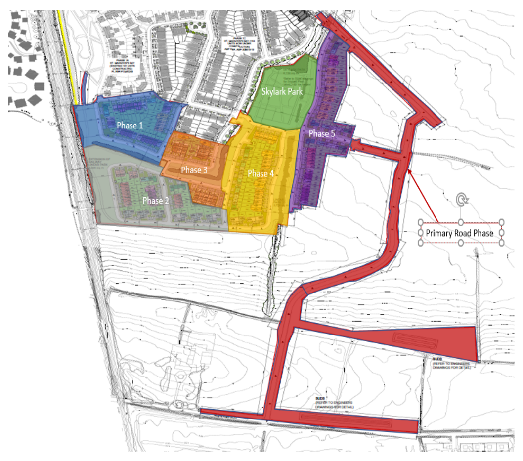
Figure 3.4: Indicative Site Construction Phasing Plan.

The existing construction compound which was agreed with FCC as part planning compliance as part of Phase 1C (ABP Ref.: ABP-305619-19 refers) will continue to be used during the Construction Phase of the Proposed Development. The existing construction compound is located to the east of the townland boundary adjacent to Phase 1B.