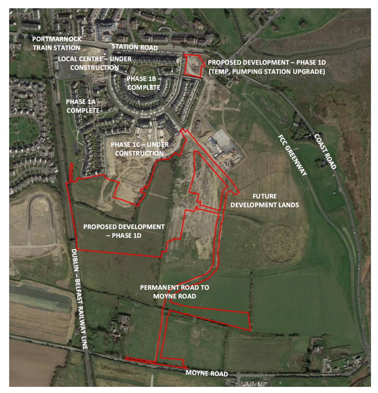
Figure 3.1: Extract from Google Earth showing the Site outlined in red (Overlay by SLA). Please refer to the Site Location Map and Site Layout Plan, prepared by Burke Kennedy Doyle Architects for further detail.